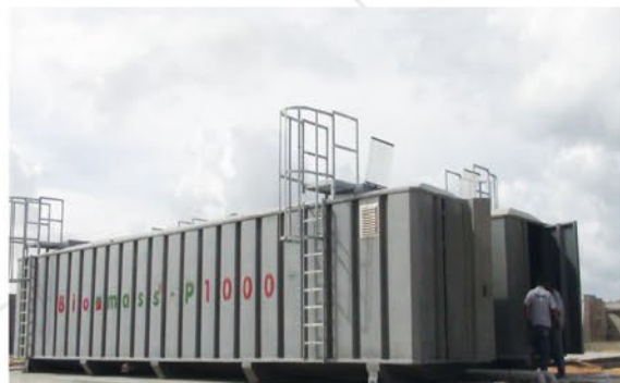
STP Sewage Treatment Plant